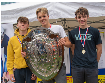
Team - Velo Club Venta